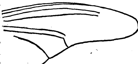
Tip of wing of Platephemera , restored by Dr. Hagen's data.

2. To carry out this hypothesis of an Odonate structure, Dr. Hagen is compelled to say that "something less than 20 mm. of the tip are wanting." To add only 15 mm., as is done by the dotted lines in the accompanying sketch, would, on the most favorable showing, make a wing of ridiculously extravagant appearance; the course of the known portion of the lower margin will not allow us to suppose, at the outside, more than 5 mm., and probably not more than 2 mm. of the tip to be lost.