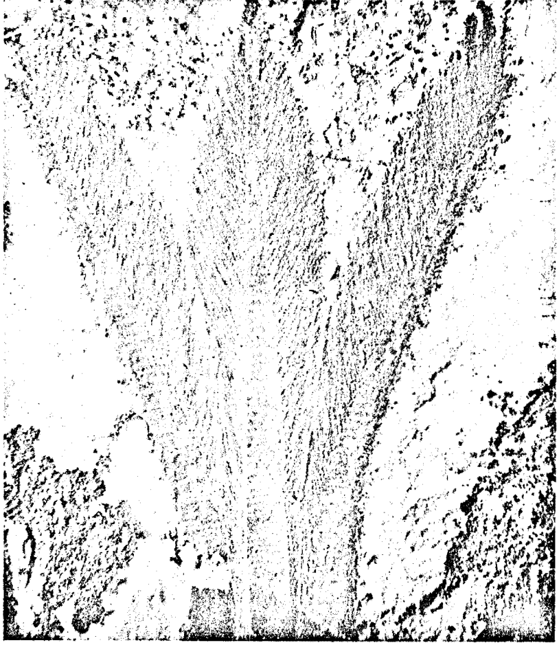
Upper: Ephemeroptera trisetalis FICHWALD. Lower Cretaceous, Chao-yang, Jehol. Small specimens. About x2. Lower: The same; caudal setae. About x12.