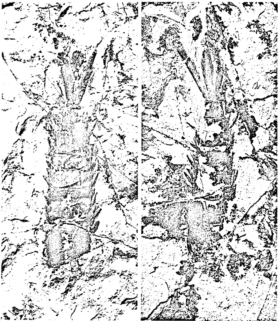
Ephemeroptera trisetalis EICHWALD. Lower Cretaceous, Chao-yang, Jehol. About 1/3 nat. size.