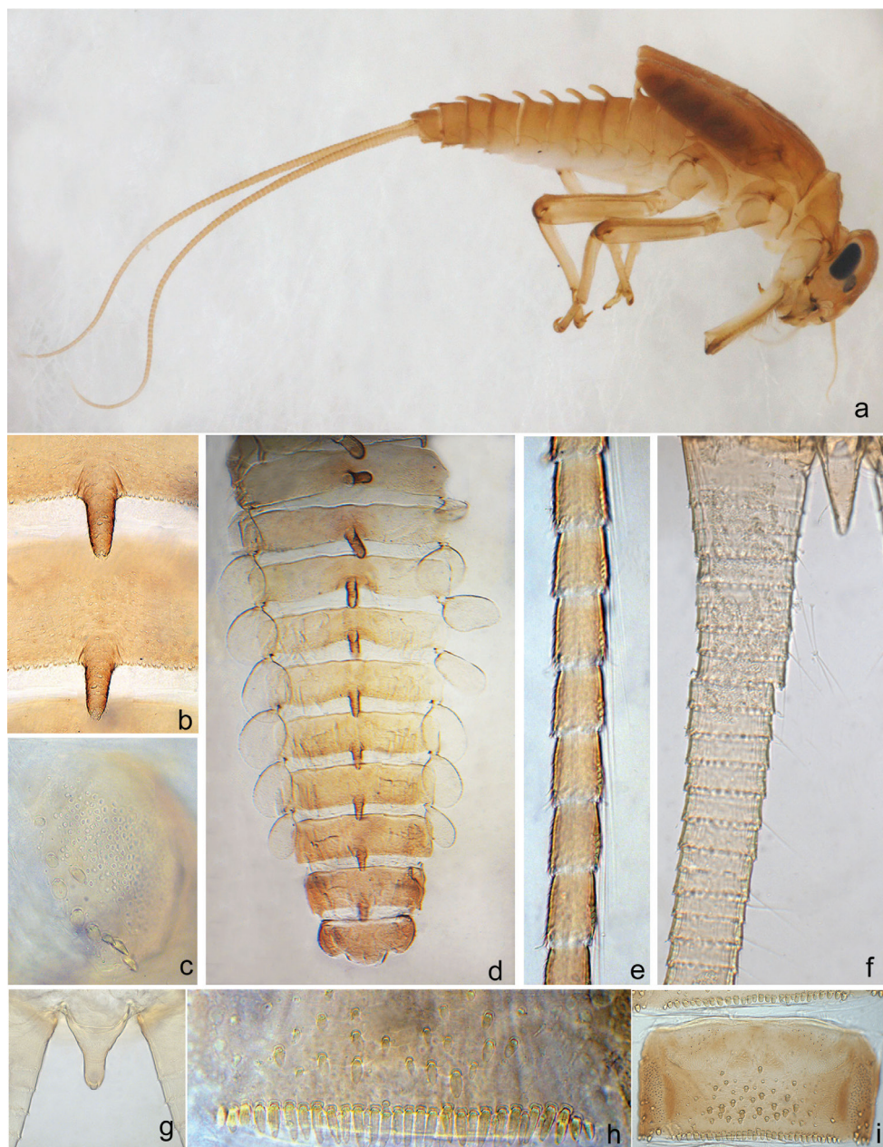
Figure 2. G. baibungensis sp. n. (a–e, g, h), G. narumona (f) and G. sororculaenadinae (i). a habitus of lateral view b protrusion on abdominal terga VI–VII c paraproct d abdominal terga I–X e inner marginal bristles on cerci f inner marginal bristles on cerci g terminal filament h posterior margin of abdominal sterna VIII i sterna VII–VIII.

and approximately one third of tergum length on segment IX; surface of protuberance scattered with scale-like setae (Fig. 2b). Terga surface with scattered scale-like and fine setae, posterior margin with blunt denticles. Surface of sterna scattered with round