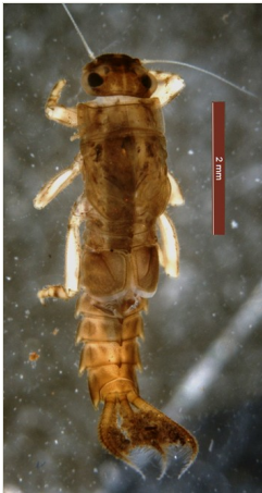
Figure 1. Dorsal view of Potamanthellus caenoides Ulmer 1939.

Potamanthellus caenoides is distinguished from other species of Potamanthellus by the following combination of characters in larvae: (i) a distinct diagonal ridge on operculate gills (Fig. 1); (ii) distinct tubercles on abdominal terga 6–8 (Fig. 1); (iii) dorsal forefemora with transverse row of setae (Fig. 2); (iv) relatively small body size (<8 mm) (Fig. 1) and (v) relatively short caudal filaments that possess strongly developed lateral setae (Fig. 1). P. caenoides is distinguished from closely related species P. ganges by the following characters: (i) posteromedian tubercle on abdominal terga 1–2 and 6–8 distinct (Fig. 1); (ii) rows of hairlike setae strongly developed and mature body ca. 6–8 mm (Fig. 1) and (iii) dorsal forefemora with transverse row of setae (Fig. 2).