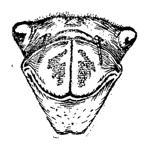
Fig. 6 Face of nymph of Sympetrum illotum Hagen, showing the enormous mask shaped labium

a Burrowing nymphs, with depressed, wedged-shaped heads, abbreviated and flattened antennae, approximated fore legs, and external burrowing hooks at the ends of the fore and middle tibiae. These burrow along on the bottom of the pond or stream, just beneath the layer of silt, with the tip of the abdomen turned upward and reaching the water for respiration (Gomphinae)