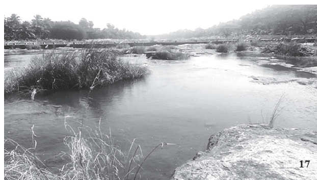
Fig. 17. Habitat of Sparsorythus chitturensis sp. nov.