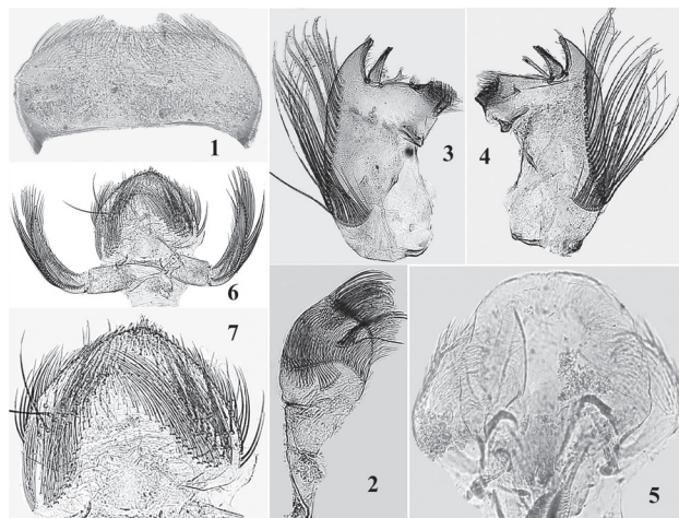
Figs. (1-7) Mature nymph Sparsorythus chitturensis sp. nov. dorsal view: (1) labrum, (2) maxillae, (3) right mandible, (4) left mandible, (5) hypopharynx, (6) labium, (7) glossae enlarged.

rill in the middle; and right prostheca bifurcated, with a few number of projections, bearing several setae on the inner side of S. Ceylonicus (Sroka and