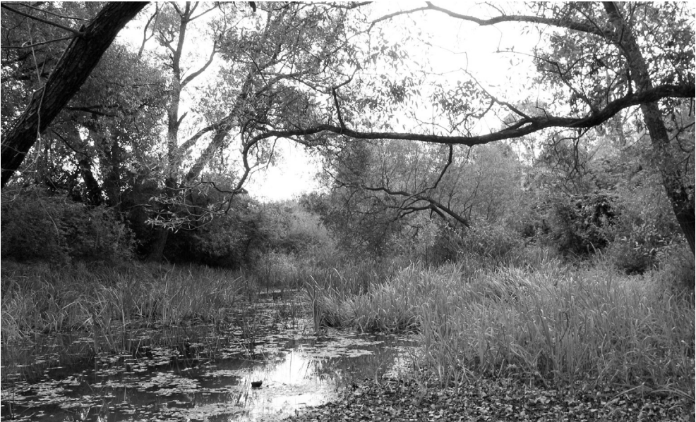
Fig. 2. A nearly undisturbed habitat: the Batár at Magosliget, autumn, 2006