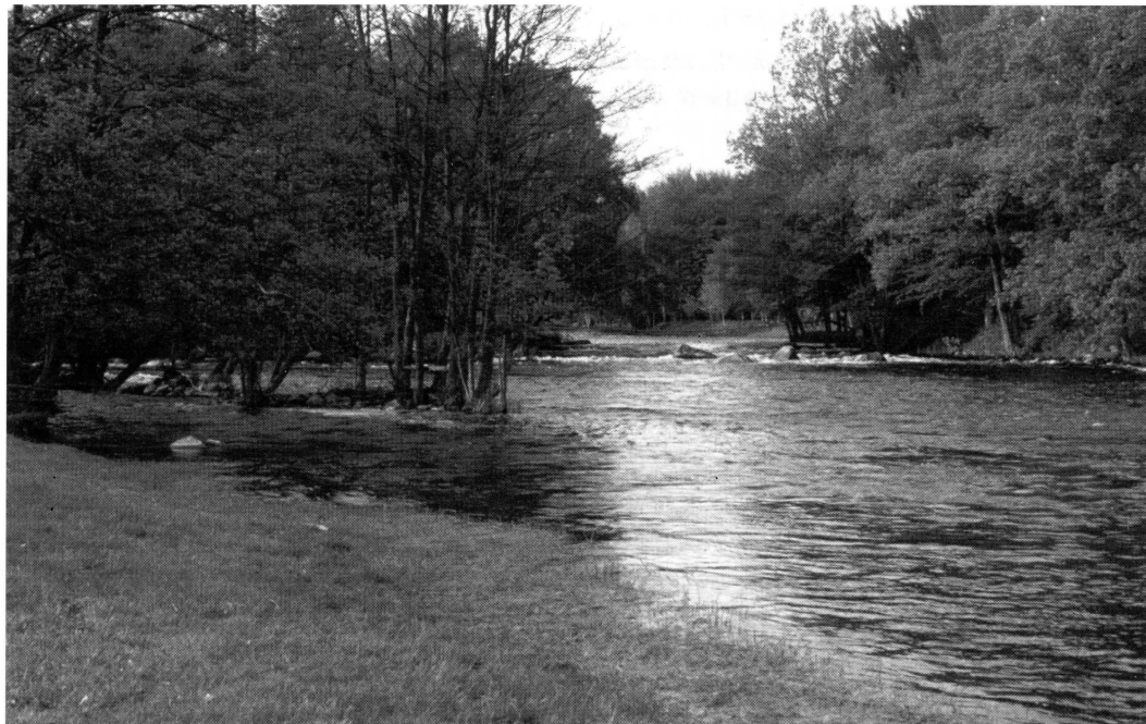
Mörrum River (4:6) on 1 June 1986 home for Baetis liebenauae . La rivière Mörrum (4:6) le 1 er juin 1986: site de Baetis liebenauae .

B. liebenauae inhabits slow water in Italy and rather fast water in Poland (BUFFAGNI & GOMBA 1996). A speed of 1 m/s has been mentioned for Austria (BAUERNFEIND 1990). In Sweden and at Kola Peninsula, B. liebenauae seems to favour rivers with currents of 0.5-1 m/s.